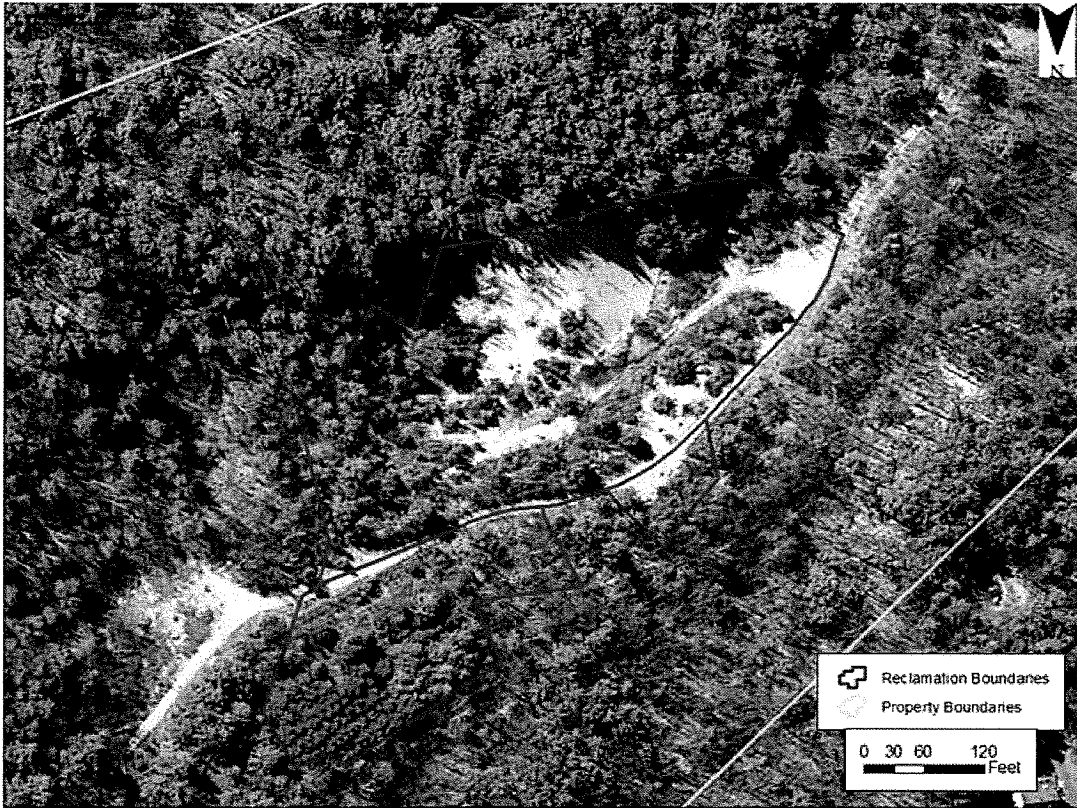
Figure 1: Gravel pit reclamation boundaries.