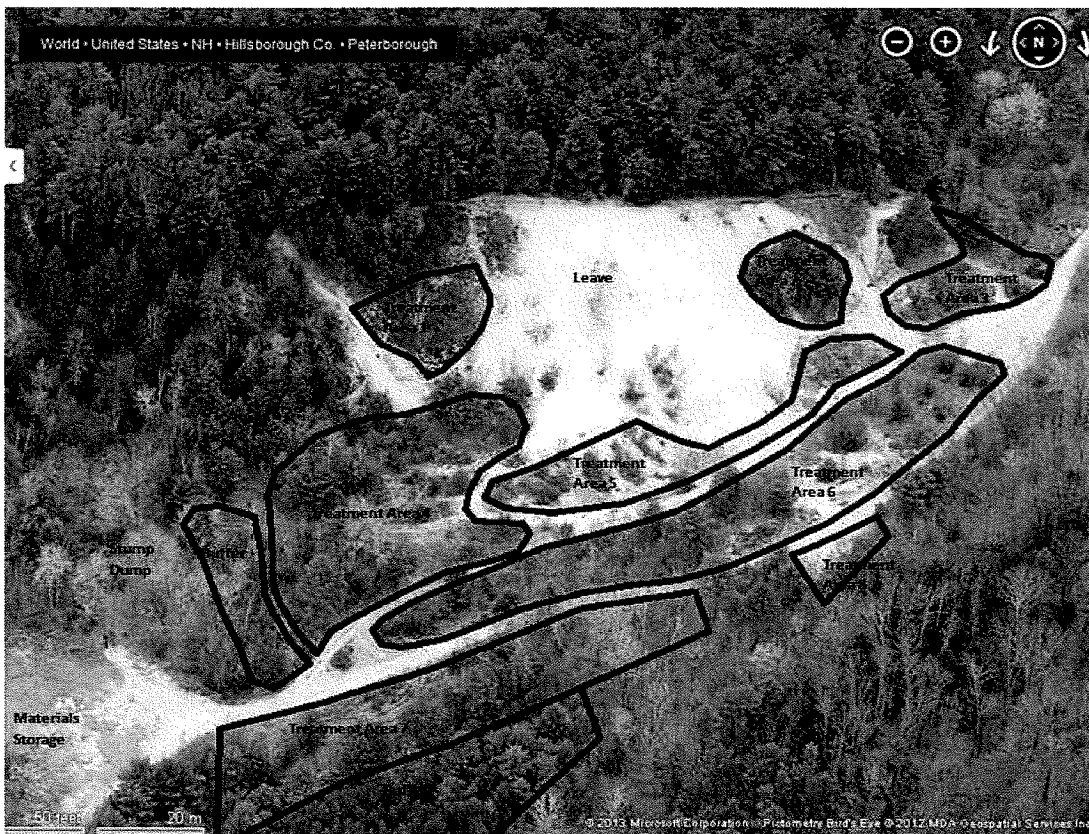
Figure 2: Treatment area delineations (image from Microsoft Bing Maps, Bird's Eye view).